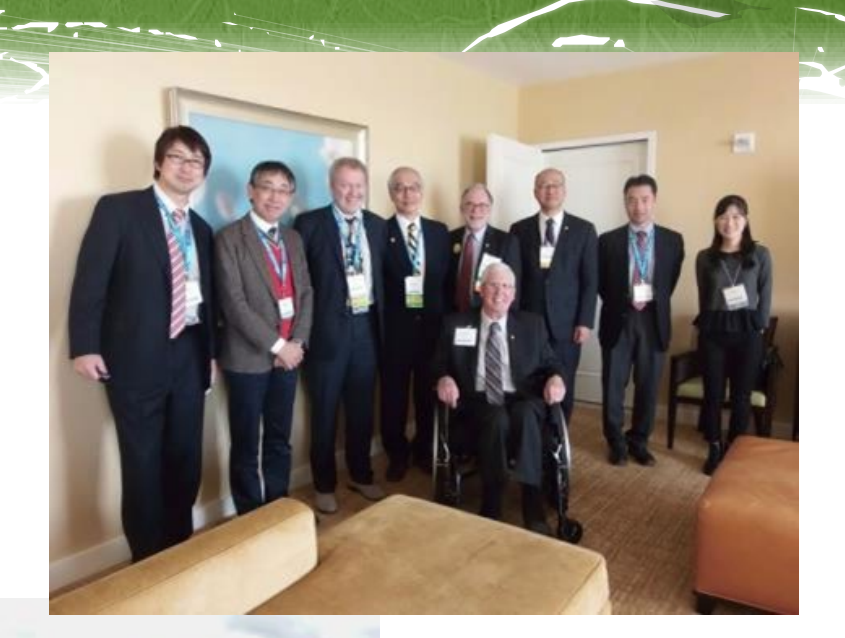
Japan Session 01/26/2016 at ASHRAE Winter Meeting,