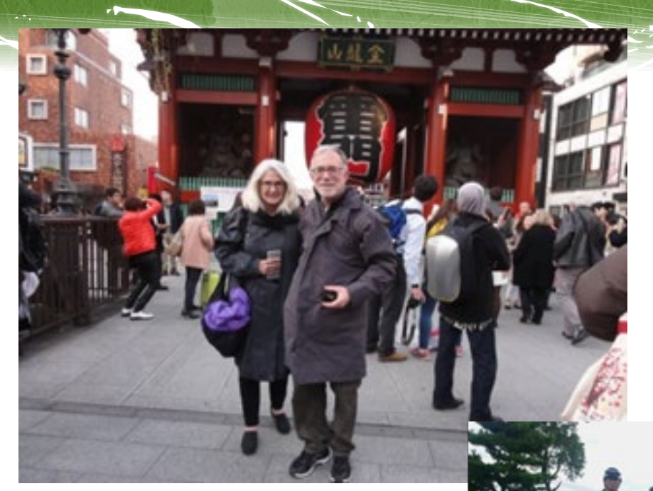
"President's Day" 03/28/2016 at Asakusa, Tokyo